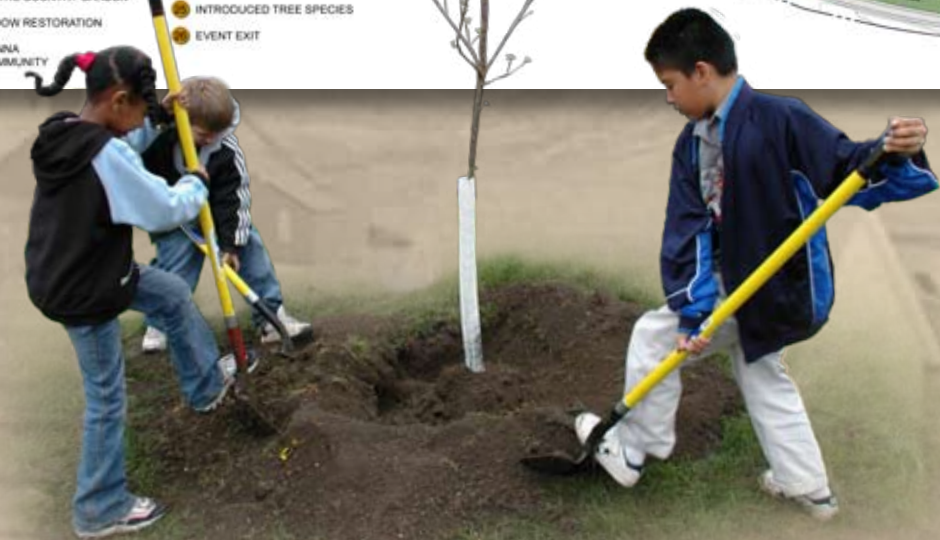
Students from Terry Redlin Elementary School planting trees at the Mary Jo Wegner Arboretum.